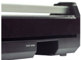
Corner Cutter Rounder